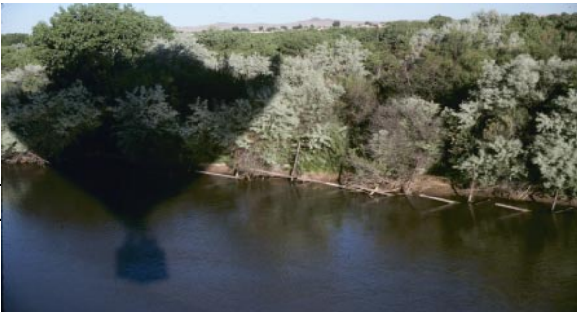
Balloonists view of Rio Grande Floodplain Community in Albuquerque